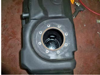
(Fig. 3) Leave the "O" ring gasket, studs and retainers assembled as they are (shown before sending unit, top flange, and 3/8" nylon Locking nuts are installed).