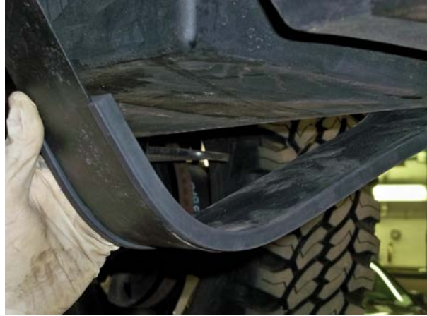
(Fig. 13) Rubber bushings installed on straps when optional TITAN Shield is not used.