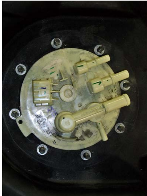
(Fig. 6) Be sure the sending unit is "clocked" nearly the same as in the OEM tank. If the tab was trimmed as in Fig. 5, place the sending unit and rotate it slightly more clockwise until it clears the studs as shown.