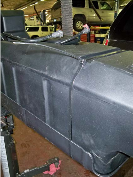
(Fig. 11) Use Quick Tie to fasten shield at front of tank at indentations. Cut off extra.