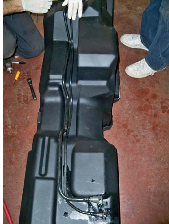
(Fig. 8) Attach the fuel lines to the sending unit and lay them in the retaining groove provided on the top of the replacement tank.