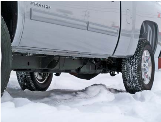
(Fig. 14) Installation Complete!