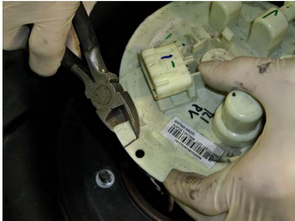
(Fig. 5) If sending unit connections interfere with the mounting studs, trim ½" off the side of the tab nearest the electrical connector.