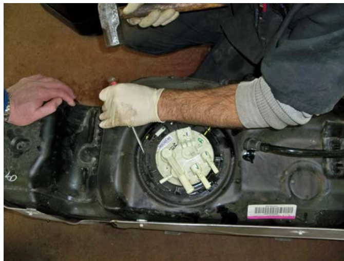
(Fig. 2) Loosen hold-down ring on OEM tank by tapping counter-clockwise, remove and lift out sending unit.