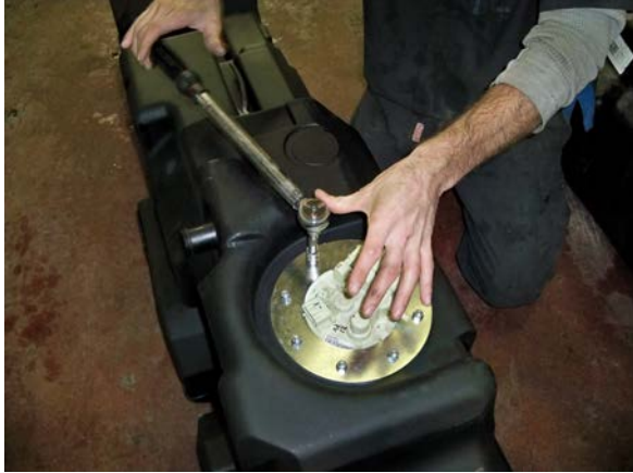
(Fig. 7) Using a torque wrench, tighten the top Flange nuts to 20 ft. lbs. using a "star" pattern.