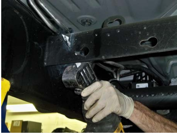
(Fig. 9) Cut jig bracket with saw or grinder.