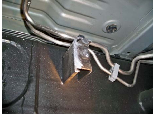
(Fig. 10) Jig bracket shown cut away leaving weldment holding fuel lines.