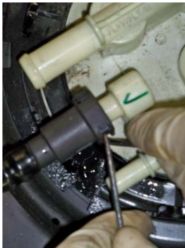
(Fig. 1) Disconnect fuel lines at the sending unit using pick.