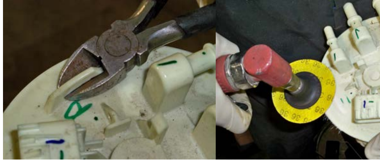
(Fig. 4) If sending unit is equipped with curved ribs on the top, either shave approximately 1/16" off the outside surface of both, or remove the rib closest to the electrical plug using dikes and a hand grinder-sander as shown above so top flange will fit correctly. Be sure surface is perfectly smooth and even to prevent breakage when top flange is tightened.