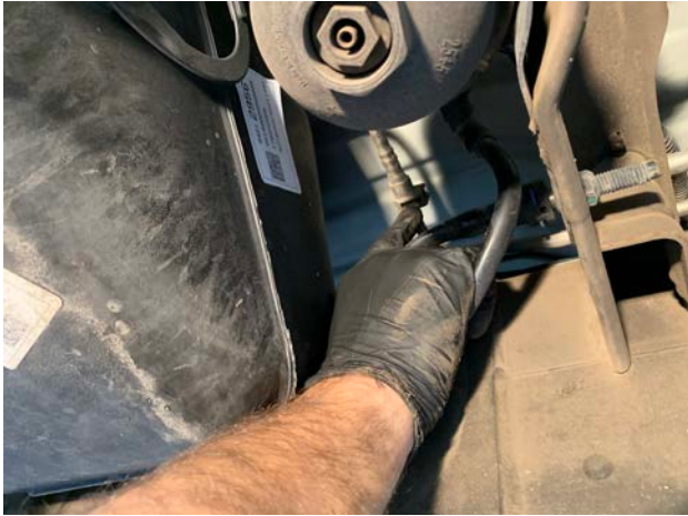
(Fig. 1) Disconnect fuel lines at the front of the OEM tank near the water separator.