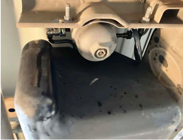
(Fig. 8) Water separator and fuel line connections at front of the new tank.