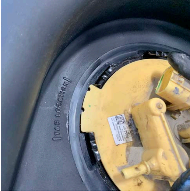
(Fig 4) Line tab on sending unit up with "Tab Location" marks on the TITAN tank.