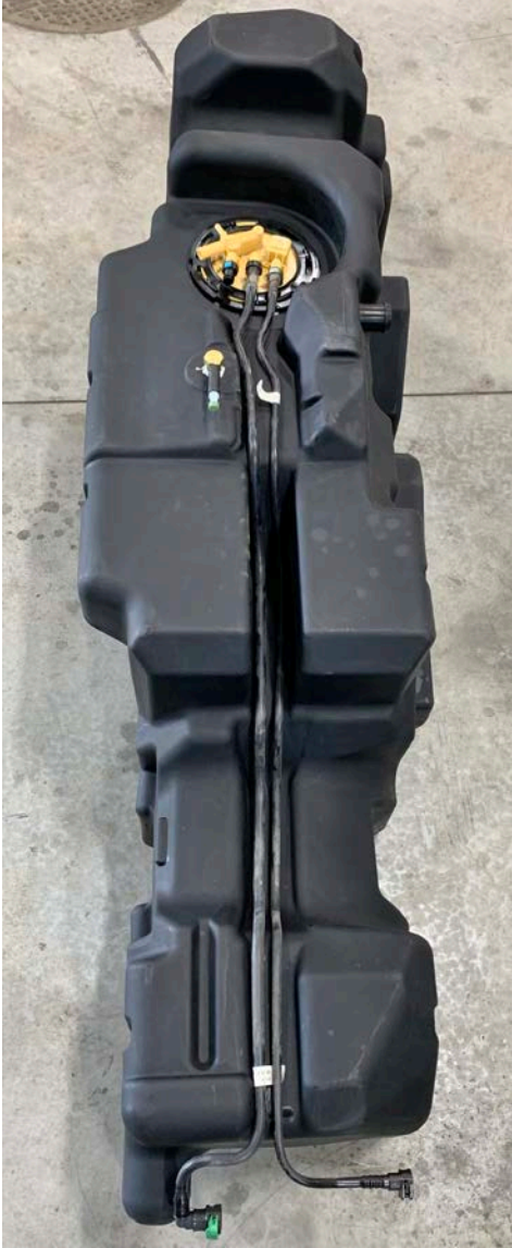
(Fig. 6) New TTITAN tank with fuel lines connected to the sending unit and in place.