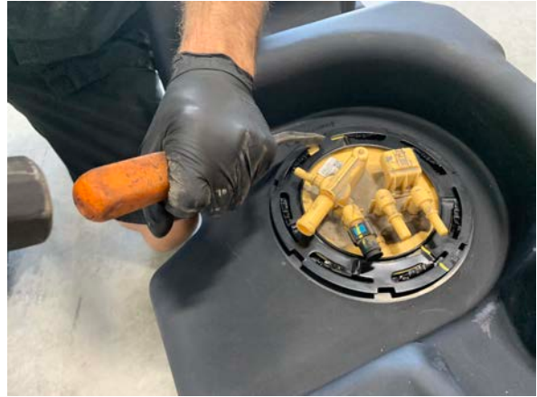
(Fig. 5) Tighten the top TITAN Torque hold-down ring onto the sending unit by turning it clockwise as far as it will go.