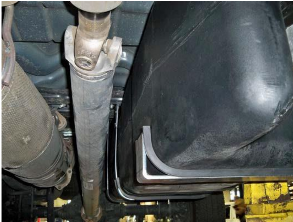
(Fig. 12) Installation of front support. Note the flexible bushings on the support and the straps.