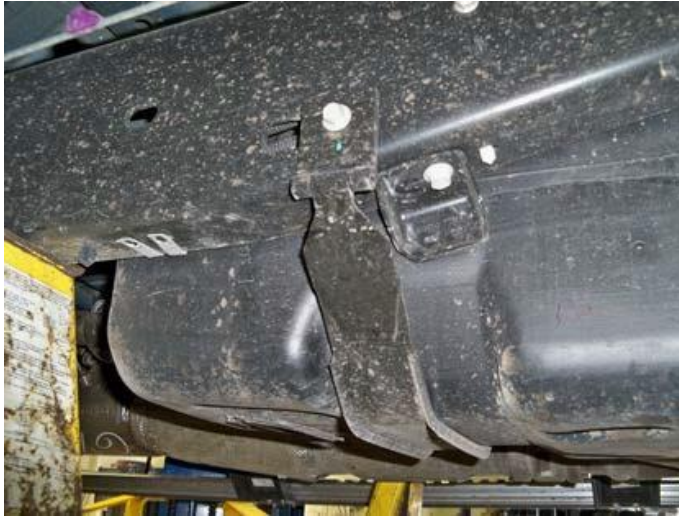
(Fig. 1) Remove original equipment strap and “bumper bracket”, shown here to the right-hand side of the front strap.