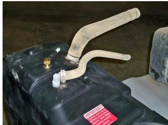
(Fig. 6) Install fill and vent hoses from original equipment tank on TITAN tank as shown. Make sure that 3/4" vent line is lined up with orientation mark on the tank.