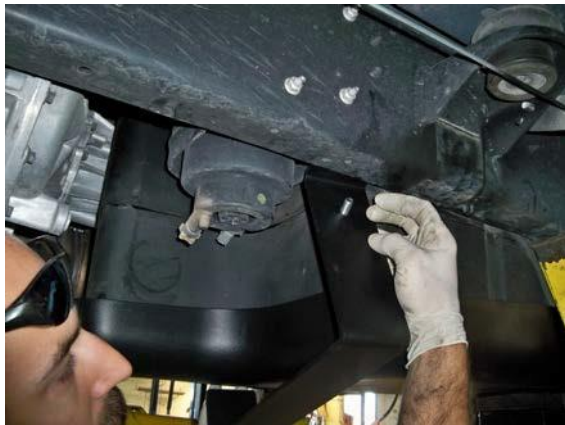
(Fig. 7) Hang lower piece of support assembly on lower lip of vehicle frame and slide towards the rear of vehicle until it lines up with cab mount.