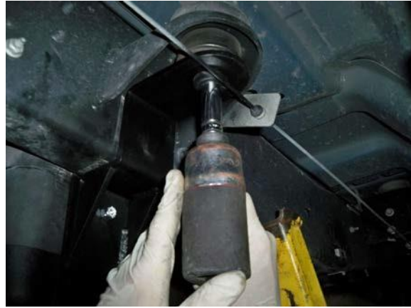
(Fig. 10) Replace cab mount bolt with its existing washers and tighten to factory specification.