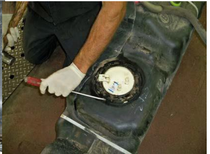
(Fig. 2) Loosen hold-down ring on original equipment tank by tapping counter-clockwise, remove and lift out sending unit.