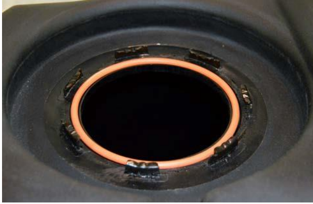
(Fig. 3) O-Ring gasket shown installed correctly.