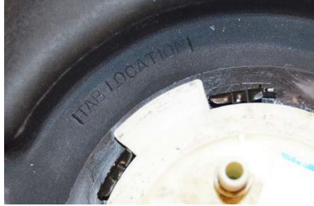
(Fig. 4) Line the sending unit tab up with the "Tab Location" markings on the tank.