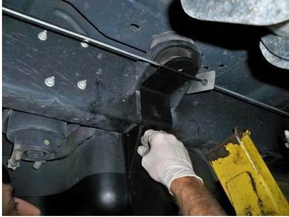
(Fig. 9) Mount the upper piece of the assembly to the lower piece using bolt provided.