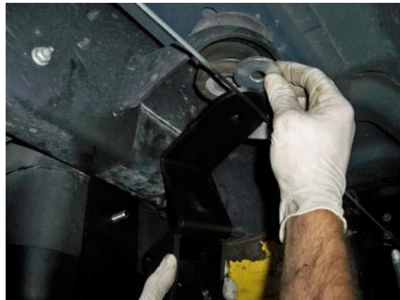
(Fig. 8) Place the supplied fender washer into the center of the rubber cab mount above the upper piece of the assembly.