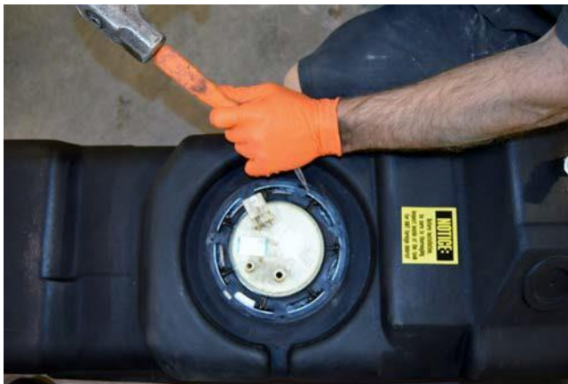
(Fig. 5) Using a hammer and punch, or screw driver to tighten the hold-down ring clockwise.