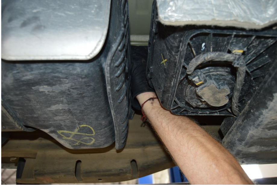
(Fig. 1) Disconnect fuel lines at the front of the OEM tank.