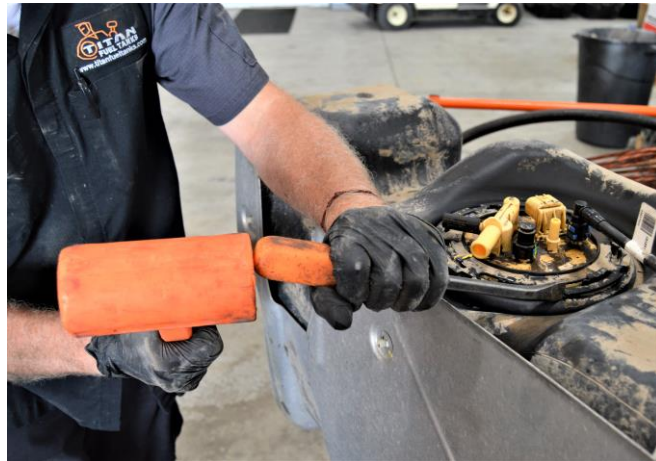
(Fig.3) Loosen hold-down ring on OEM tank by tapping counter-clockwise, remove and lift out sending unit.