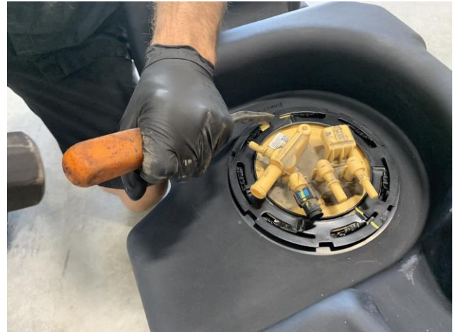
(Fig. 5) Tighten the top TITAN Torque hold-down ring onto the sending unit by turning it clockwise as far as it will go.