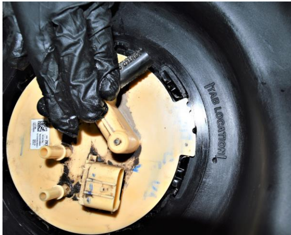
(Fig 4) Line tab on sending unit up with "Tab Location" marks on the TITAN tank.