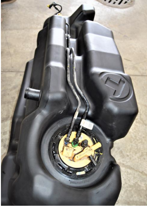
(Fig. 6) New TTITAN tank with fuel lines connected to the sending unit and in place.