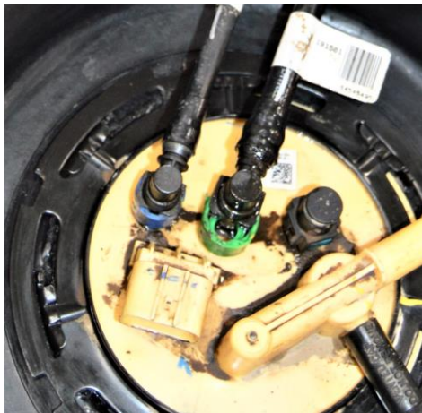
(Fig.2) Disconnect fuel lines at the sending unit using pick.