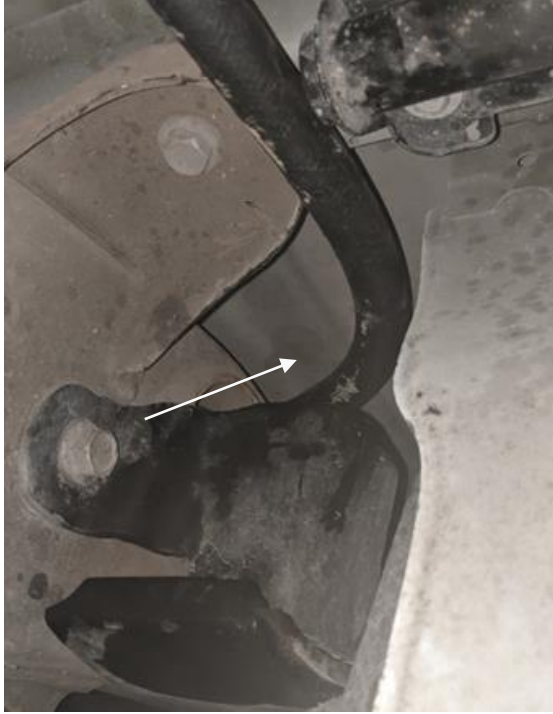
(Fig. 9) Run this 5/8" hose between the frame and truck bed.