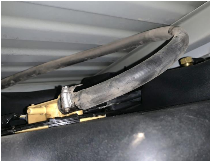
(Fig. 8) Lift tank high enough to reconnect electrical connections and vent line to the sending unit.