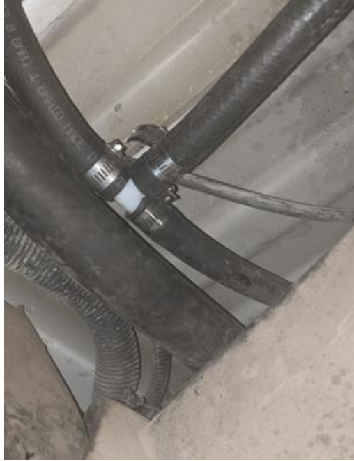
(Fig. 7) Tee adapter inserted 8" down the vent line.