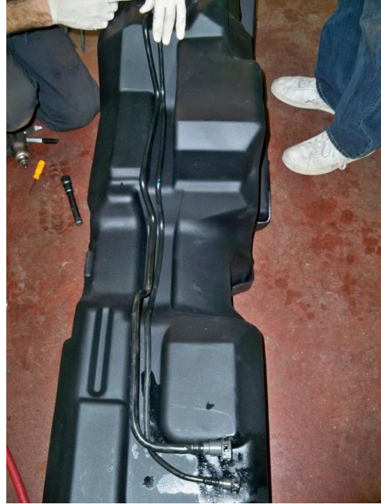
(Fig. 8) Attach the fuel lines to the sending unit and lay them in the retaining groove provided on the top of the replacement tank.