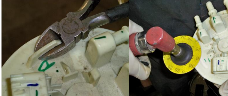
(Fig. 4) If sending unit is equipped with curved ribs on the top, either shave approximately 1/16” off the outside surface of both, or remove the rib closest to the electrical plug using dikes and a hand grinder-sander as shown above so top flange will fit correctly. Be sure surface is perfectly smooth and even to prevent breakage when top flange is tightened.