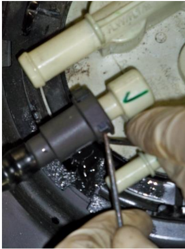
(Fig. 1) Disconnect fuel lines at the sending unit using pick.

and the electrical fitting are pointing or “clocked”, they will need to be installed the same way, at the same angle in the replacement tank. Remove the sending unit from the OEM tank. Do NOT reuse factory “O” ring seal.