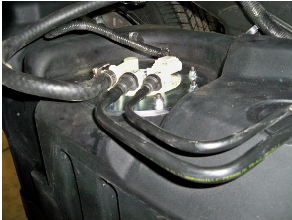
(Fig. 11) Lift tank high enough to reconnect electrical cable and vent hose to sending unit.