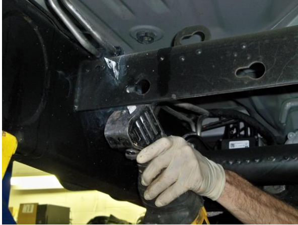
(Fig. 9) Cut jig bracket with saw or grinder.