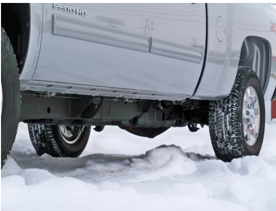
(Fig. 14) Installation Complete!