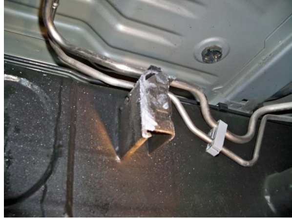
(Fig. 10) Jig bracket shown cut away leaving weldment holding fuel lines.