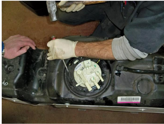
(Fig. 2) Loosen hold-down ring on OEM tank by tapping counter-clockwise, remove and lift out sending unit.