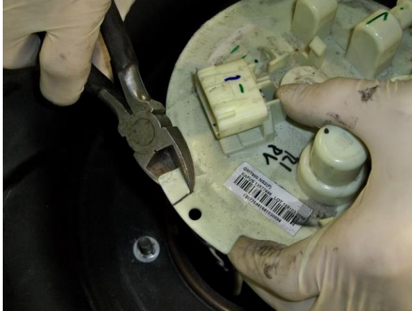
(Fig. 5) If sending unit connections interfere with the mounting studs, trim ½” off the side of the tab nearest the electrical connector.