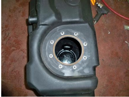
(Fig. 3) Leave the “O” ring gasket, studs and retainers assembled as they are (shown before sending unit, top flange, and 3/8” nylon Locking nuts are installed).