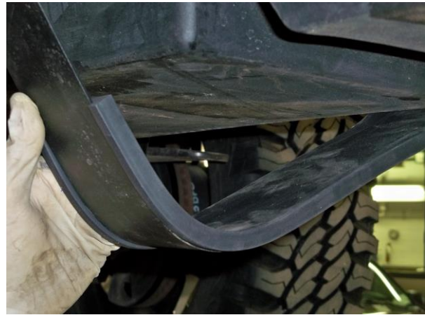
(Fig.12) Extruded bushings installed on straps.