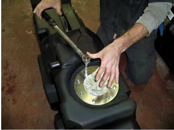
(Fig. 7) Using a torque wrench, tighten the top Flange nuts to 20 ft. lbs. using a “star” pattern.